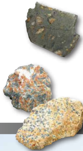
Photo: Vulcan Project Drilling, East Kootenay's BC