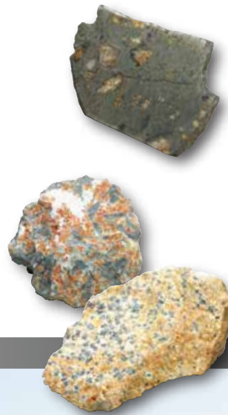
Photo: Vulcan Project Drilling, East Kootenay's BC